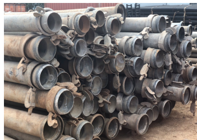
QD Piping, HDPE Piping, Hoses, & Fittings