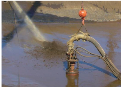
Hydraulic Power Packs & Submersible Pumps