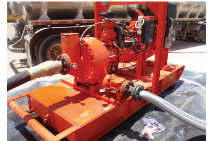
High Head Pumps for Temp Fire and Cleaning