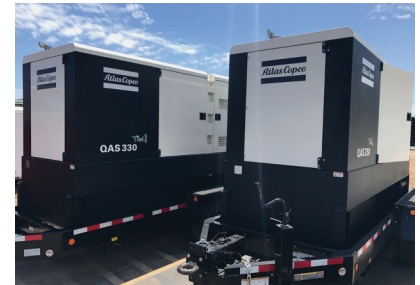
Portable & Standby Generators