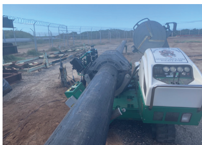
HDPE Fusion Equipment and Training