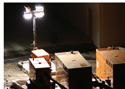
Diesel, Electric & Battery Powered Light Towers