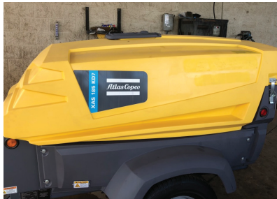
Portable & Industrial Air Compressors