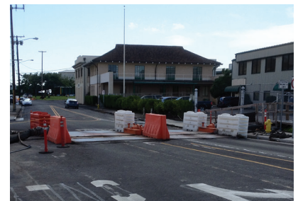
Flanged Road Crossings in a Range of Sizes