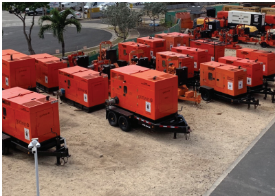
Dri-Prime Pumps for Sewer Bypassing & Dewatering