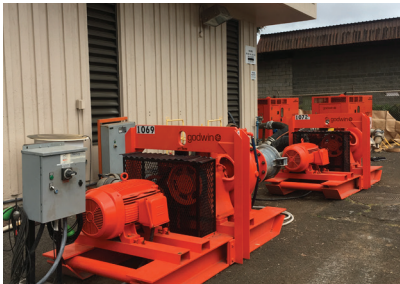
Electric Dri-Prime & Submersible Pumps