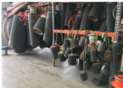
Pipe plugs, Vacuum, Joint & Mandrel Testers